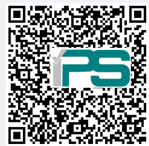
Scan QR for Certificate Authenticity, Updated Scopes and Validity!